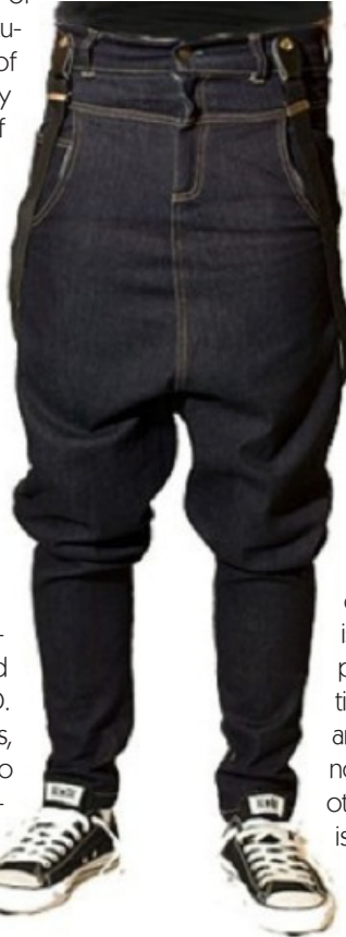
These pants are exposing just how much of an ass he is!